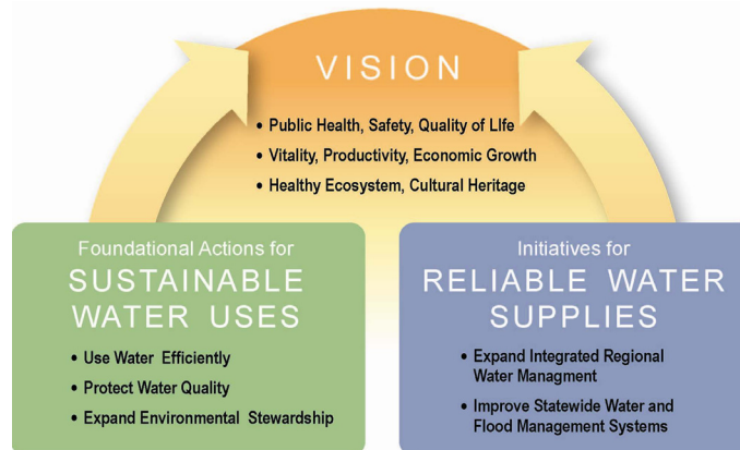
Figure 2-1 Integrated Water Management

A primary theme of Update 2005 and Update 2009 is that our policies, decisions, and actions must lead to long-term, sustainable water resource use that enhances our environment, our economy, and our communities. With creative flexibility, discipline, and innovation, we can use our groundwater and surface water resources wisely in ways that sustain their viability, expand the economy, protect the environment, and assure Californians a high quality of life. Our policies and actions must ensure sustainable water uses and reliable water supplies. On these two premises, we have identified foundational actions (use water efficiently, protect water quality, and expand environmental stewardship) and initiatives (expand integrated regional water management and improve statewide water and flood management systems). See Figure 2-1 (Integrated Water Management).