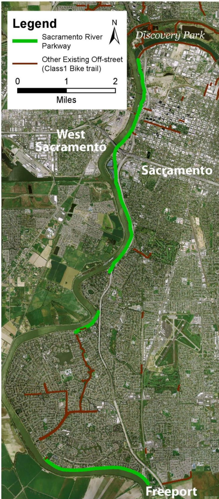
Figure 1. Sacramento River Parkway alignment