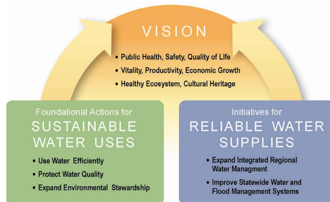
Figure 2-1 Integrated Water Management

A primary theme of Update 2005 and Update 2009 is that our policies, decisions, and actions must lead to long-term, sustainable water resource use that enhances our environment, our economy, and our communities. With creative flexibility, discipline, and innovation, we can use our groundwater and surface water resources wisely in ways that sustain their viability, expand the economy, protect the environment, and assure Californians a high quality of life. Our policies and actions must ensure sustainable water uses and reliable water supplies. On these two premises, we have identified foundational actions (use water efficiently, protect water quality, and expand environmental stewardship) and initiatives (expand integrated regional water management and improve statewide water and flood management systems). See Figure 2-1 (Integrated Water Management).